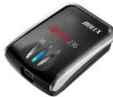
Figure 2: Holux GPS Receiver

As the students move around a physical location, such as their school playground or sports fields, a map on their handheld displays digital objects and virtual people who exist in an augmented reality world superimposed on real space (see figures 3, 4, & 5).